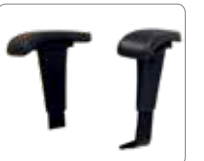
Articulating Arm Rests Part#: P-6000-D