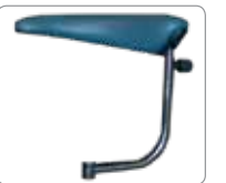
Procedure Rest Part#: P-6000-PR