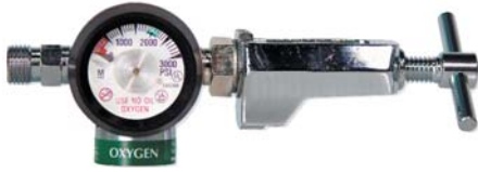
Compact Regulator with Yoke