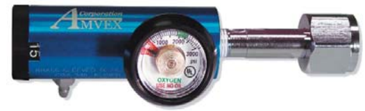
Click-Style Regulator with Nut & Nipple