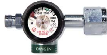
Compact Regulator with Nut & Nipple