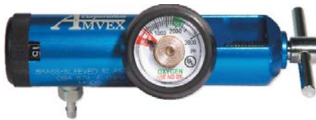
Click-Style Regulator with Yoke